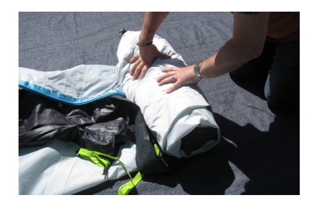
4. Place the rolled awning on to the bag and pull the sides up round it. Finally, zip up the bag.