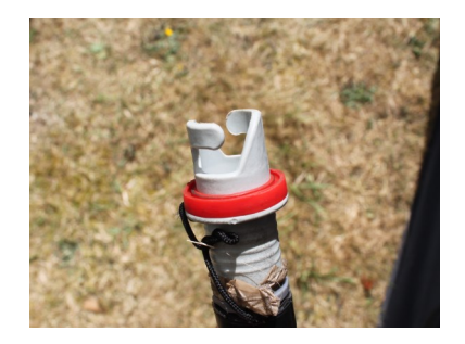
5. Replace the cap on the Dynamic Speed Valve and cover the valves with the flap to prevent water getting inside.

3. Locate the Dynamic Speed Valve and ensure the valve is closed before attaching the pump. (The valve is closed when the button is pressed out)